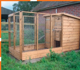
Brook with open run