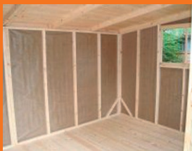
Sisal Kraft paper lining